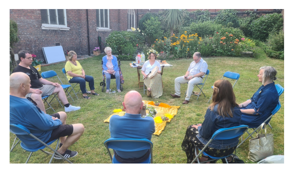
The birds in their chorus, twittering in the trees

An idyllic warm summer evening on the Chapel lawns